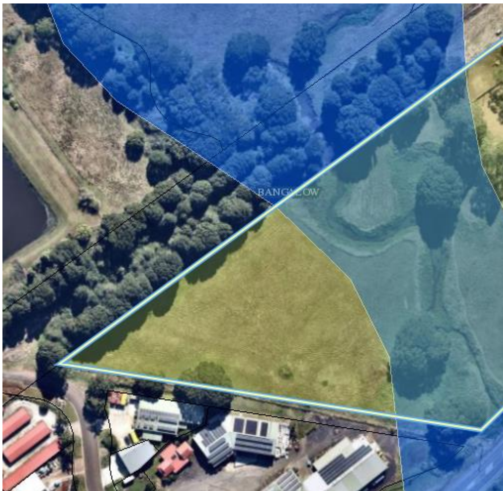
Figure 2.0. Flood prone land mapping

Part of the site is mapped as flood prone land. This is generally in relation to Maori Creek as shown in figure 2. A flood study has been prepared in support of this rezoning.