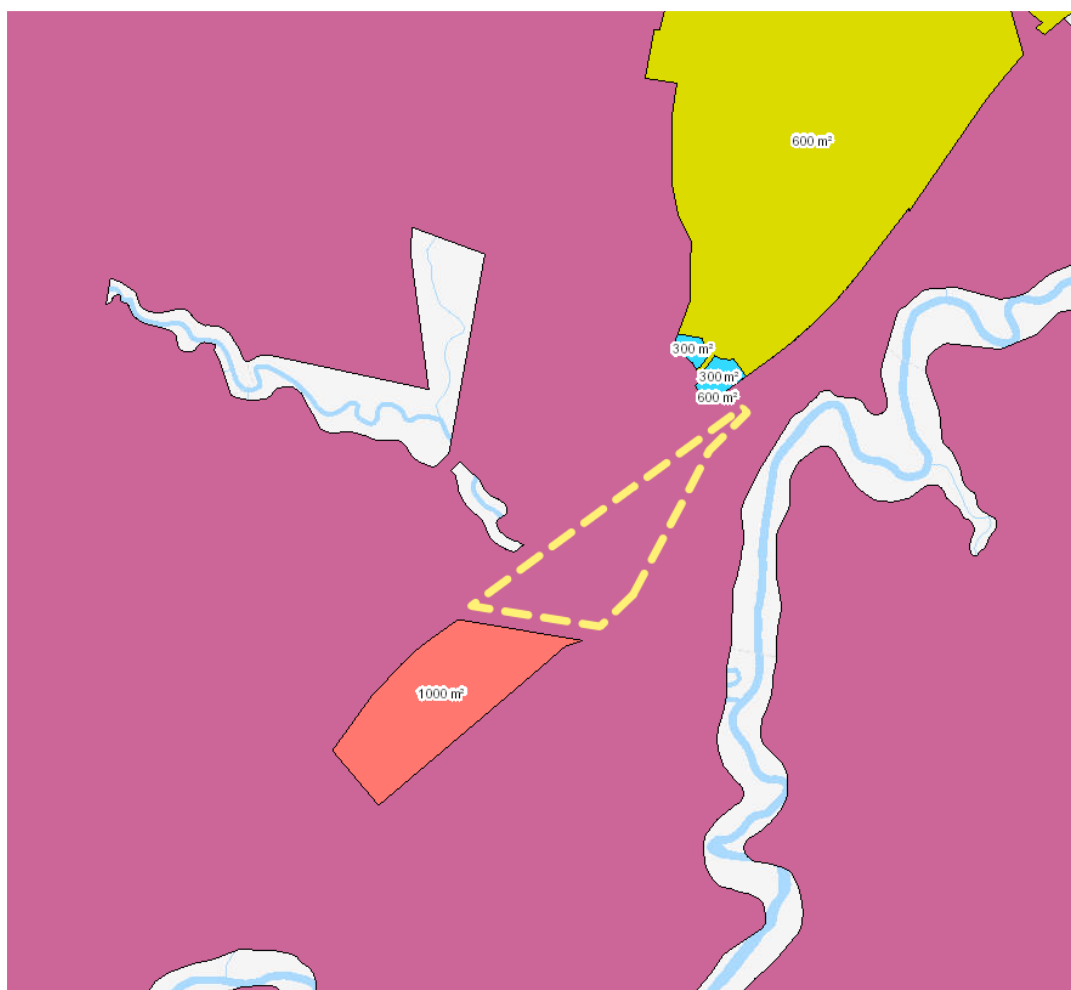
Figure 5.1. Existing lot size

Map to be created to reflect new zoned area with IN1 Lot Size of 1000m 2 , C3 with 40ha.