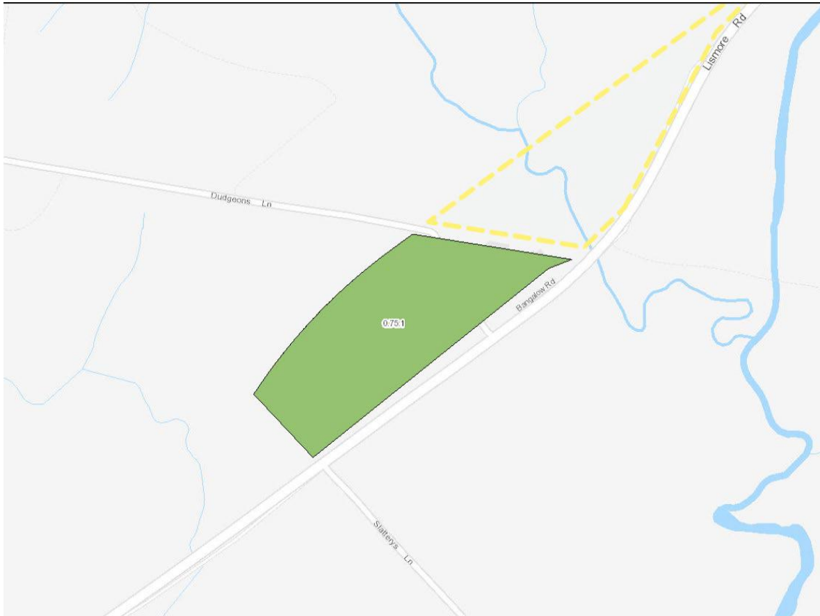
Figure 6.1. Existing floor space ratio

Map to be created to reflect new zoned area with IN1 FSR of 0.75:1. No FSR applying to C3.