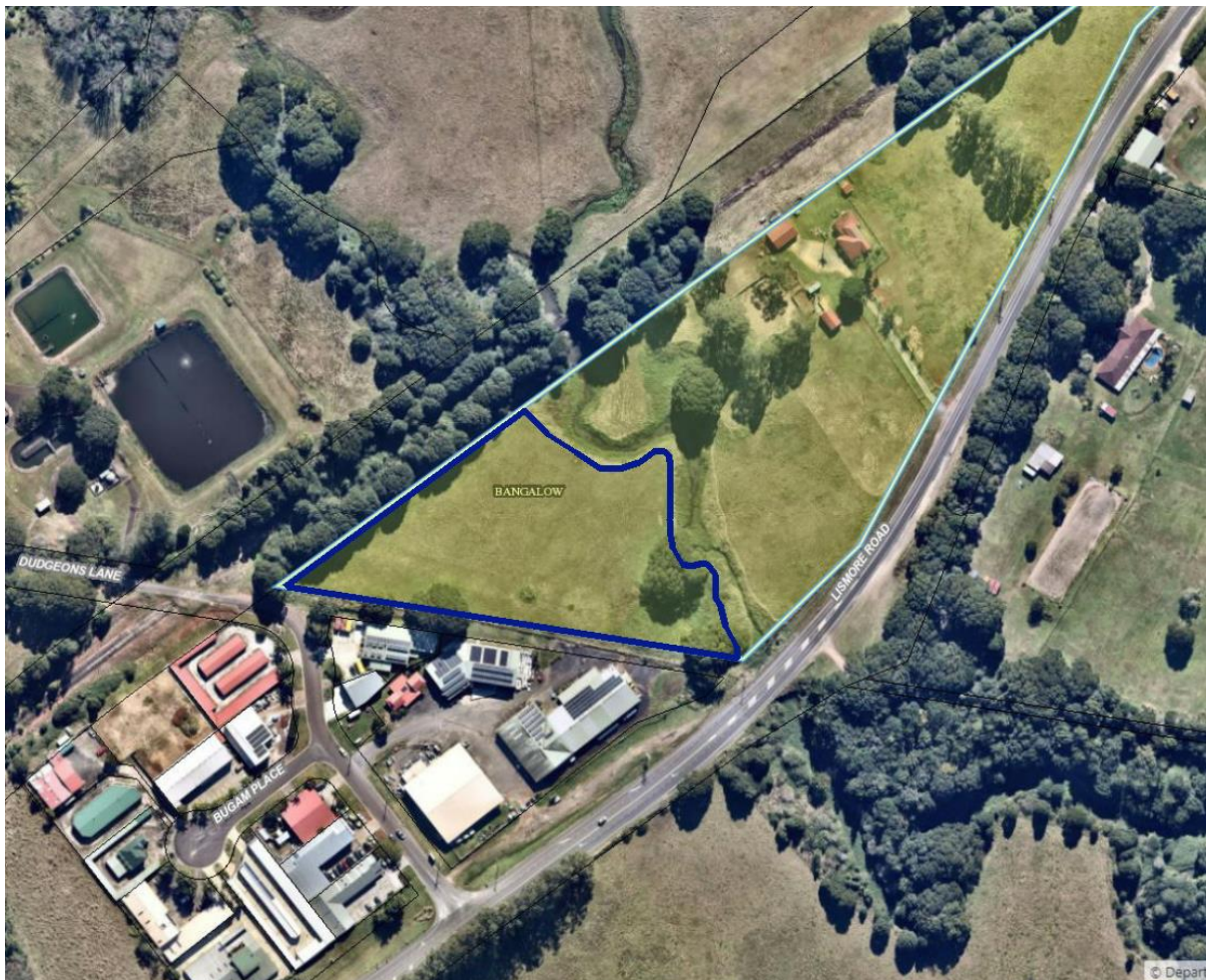
Figure 1.0. Subject site highlighted and area to be rezoned outlined in dark blue.

This planning proposal relates to part of 150 Lismore Road, Bangalow legally described as part of Lot 4 DP 635505, as shown below in Figure 1.