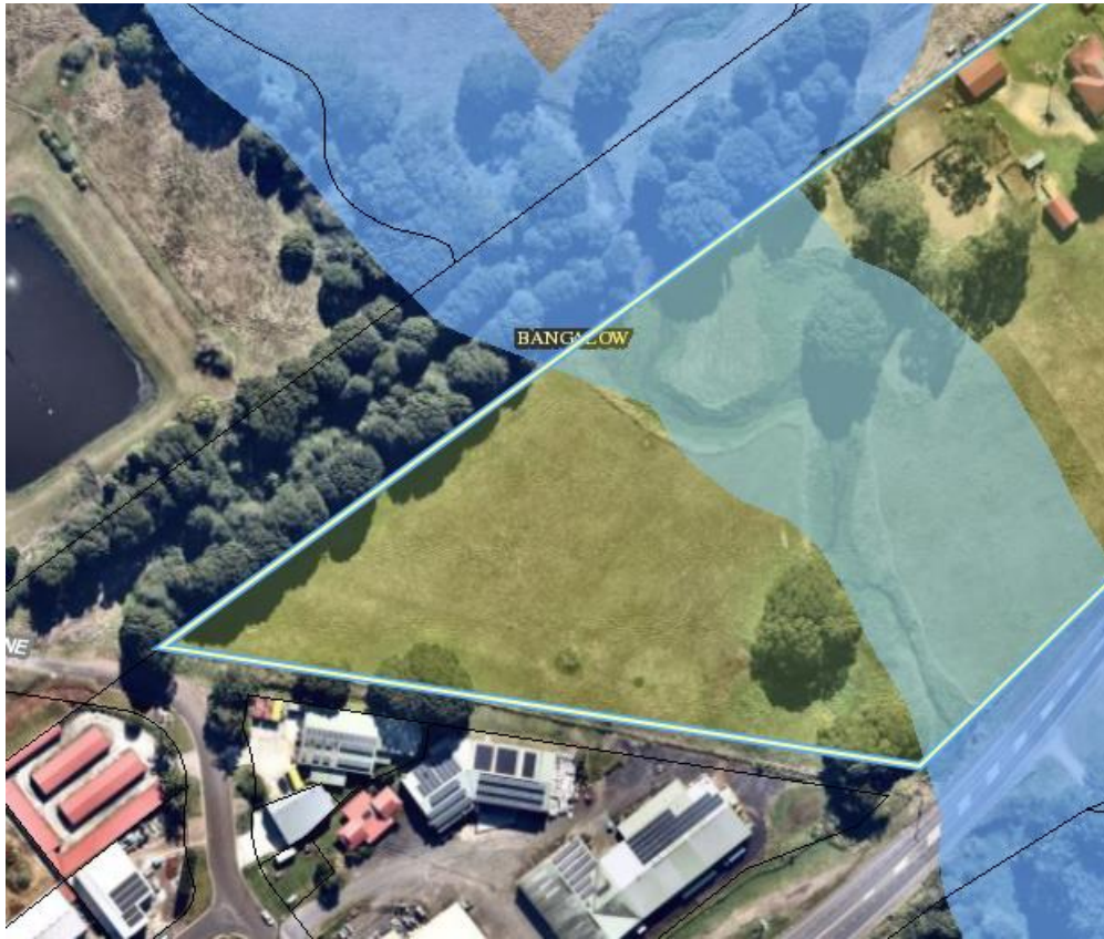
Figure 3.0. Key fish habitat

It is recommended that the planning proposal be forwarded to Department of Primary Industries, Fisheries for comment as part of the public exhibition.